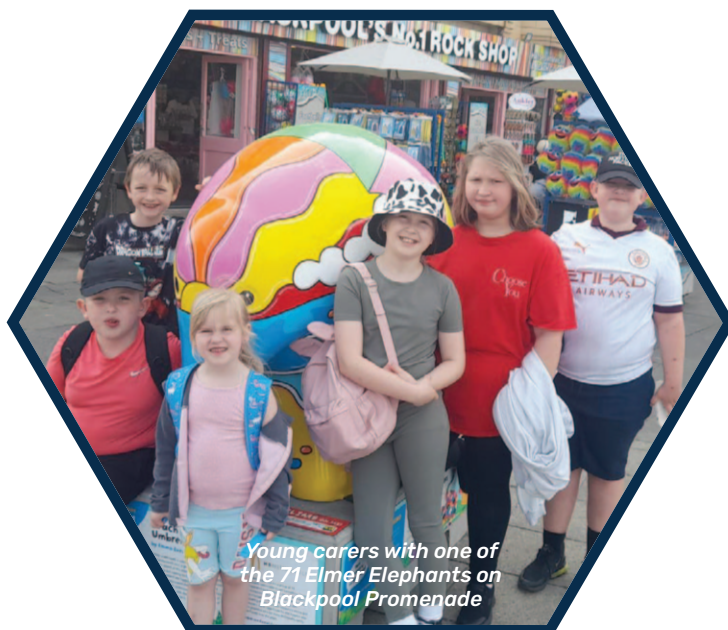
Young carers with one of the 71 Elmer Elephants on Blackpool Promenade