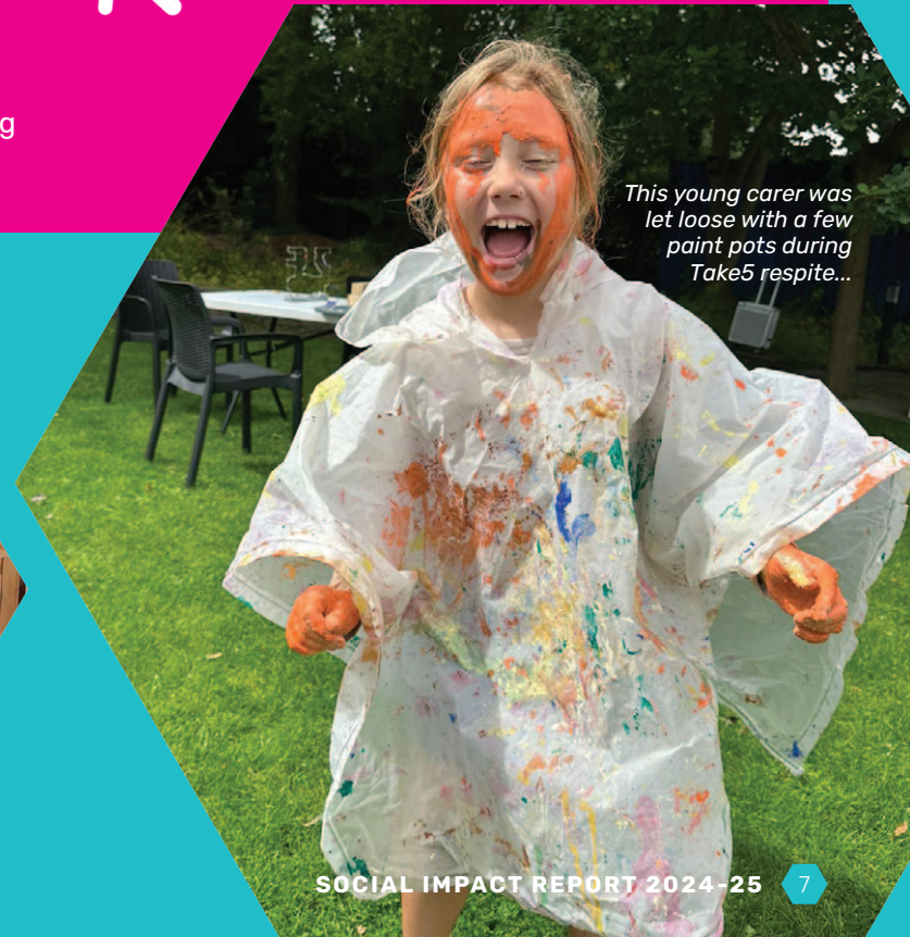
This young carer was let loose with a few paint pots during Take5 respite...