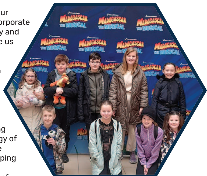
Trips with their peers are a vital form of respite for our young carers.