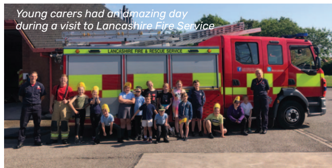
Young carers had an amazing day during a visit to Lancashire Fire Service