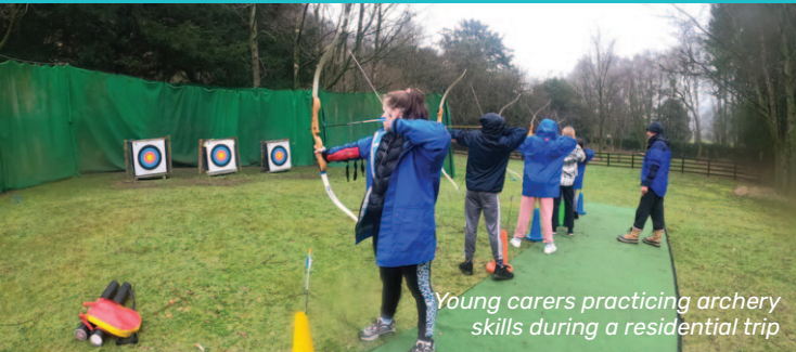
Young carers practicing archery skills during a residential trip

You've helped me to know that I can now talk to people and not keep it all to myself.