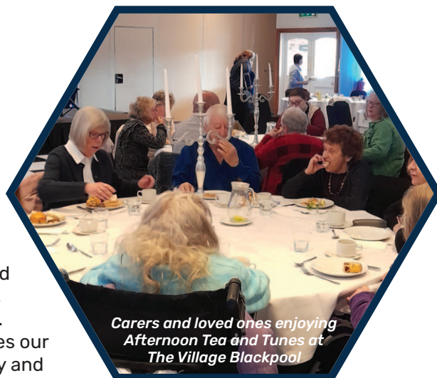
Carers and loved ones enjoying Afternoon Tea and Tunes at The Village Blackpool

Looking ahead, we remain ambitious and optimistic. With a clear strategy, strong partnerships and the energy of our incredible team, we are excited to continue developing new opportunities, raising awareness of the vital role of carers and ensuring that every carer in Blackpool has the chance of a better life.