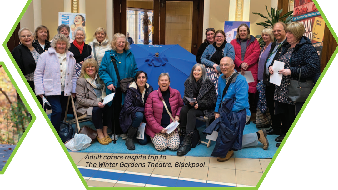
Adult carers respite trip to The Winter Gardens Theatre, Blackpool