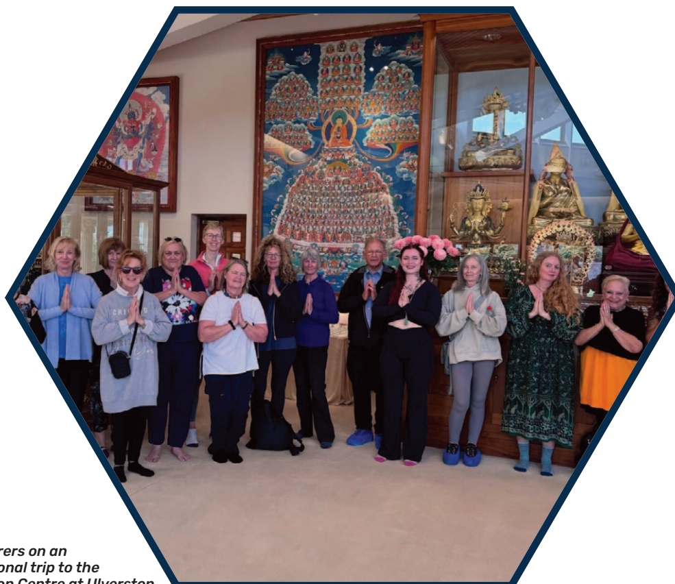
Adult carers on an inspirational trip to the Meditation Centre at Ulverston.