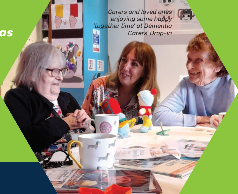
Carers and loved ones enjoying some happy 'together time' at Dementia Carers' Drop-in