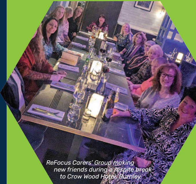
ReFocus Carers' Group making new friends during a respite break to Crow Wood Hotel, Burnley